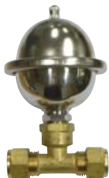
FLE-PWSA3 & FLE-PWSA3TEE